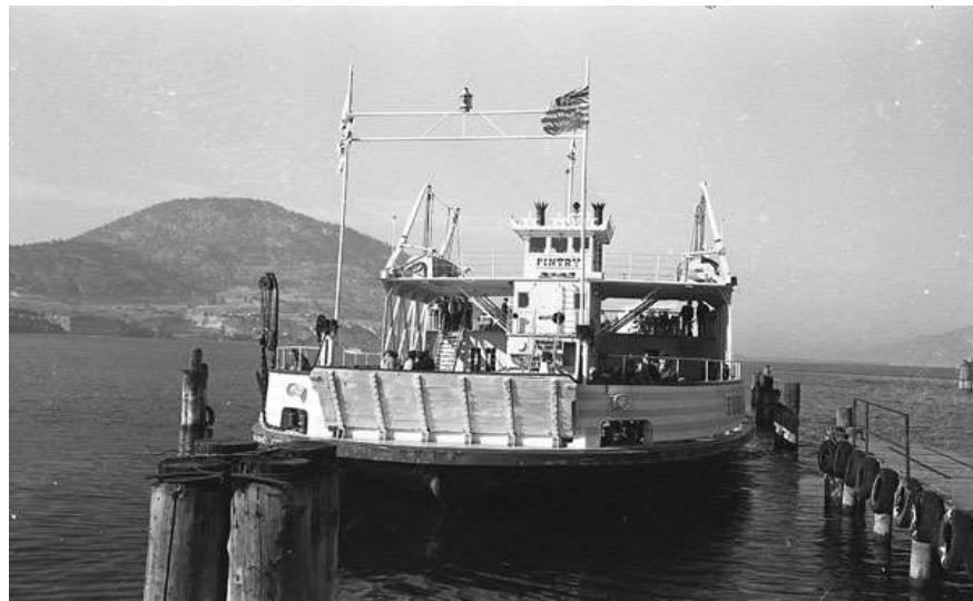
The MV Fintry at the foot of Main Street in Penticton during the 1970's

During 2023 we will prepare agreements, renovate the ship and renew Transport Canada certifications. Construction for landing facilities would start early in 2024 for scheduled service by June.